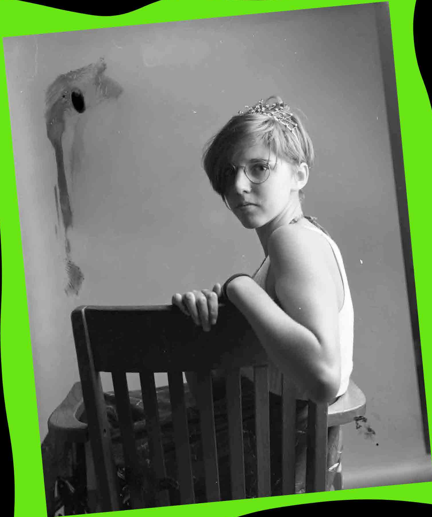
Analog Adventures Group Work

7 students received digital and analog cameras and equipment through our equipment donation program